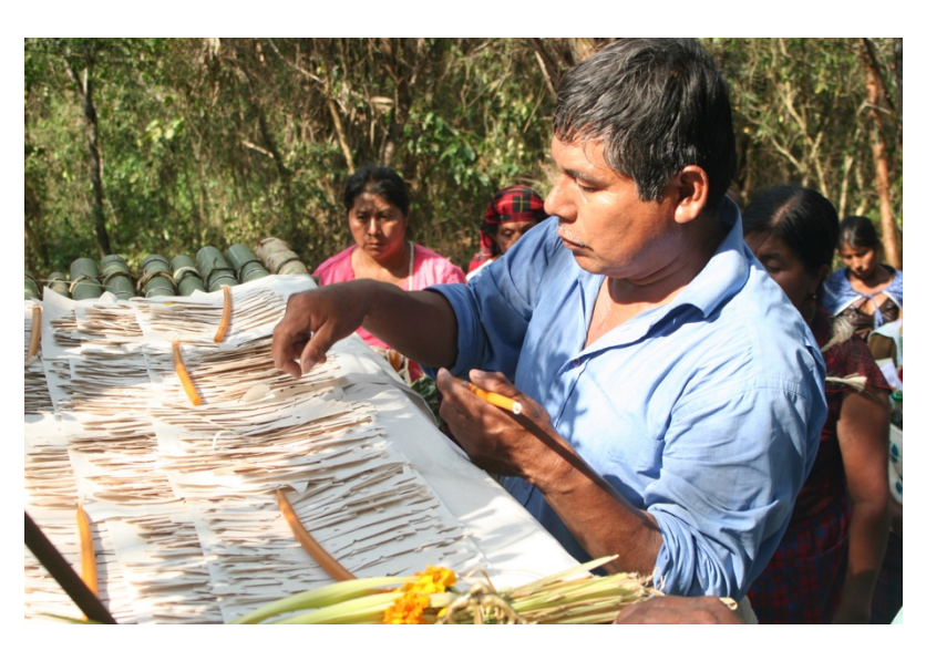
Figure 3: Master of ceremonies arranging the cut-paper images (tlatecmeh) on an altar on top of the mountain, near Cuatro Caminos.

voluntary, in fact, are social contracts that function on the basis of these three principles. In Nahua society, the system of labor exchange is one of the reciprocal principles of social interrelation, a characteristic of still being self-sufficient for their basic economic needs. Thus, following Mauss' ideas, communal reciprocity is a collective contract based on the necessity of individuals to cooperate with each other with small and large tasks in private and public settings. For example, women, who generally are responsible for