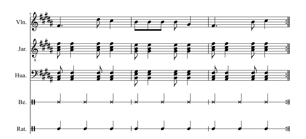
Figure 7: Xochitl son "Walking Towards the Mountain." Transcription by Veronica Pacheco. Pitch adjusted to A440 for transcription. ▶=115

Figures 6 and 7 are two examples that illustrate how the large structure of musical pieces mirrors the instances and moods that take place in the ceremony. The differences are marked by variations in the melodies, tempo, and dynamics. Even if each piece employs a different melody, some of the melodic variations are subtle to the point that, for the untrained listener, they are difficult to discern. Furthermore, the melodic units repeat several times for the period that an instance is taking place, and in some cases, these take a long time. Repetitions are also divided among the melodic phrases. For example, in one of the pieces structured with two melodic units of four measures each, the repetitions were different for each unit. The first part of the melodic phrase repeated seven consecutive times, while the second section repeated six times. This cycle resulted in a structure of 52 measures, which returned several times. Considering the endless possibility of repetitions of the melodic units, I identify this form as cyclical, which I believe also contributes to engaged participation. I will later return to this characteristic of the music structure and its association with participation.