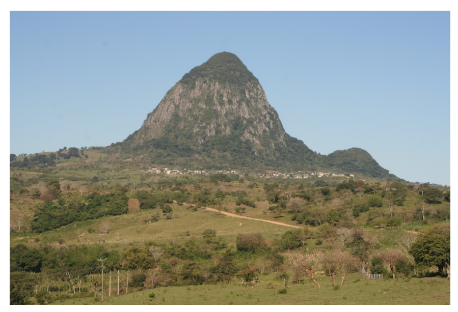
Figure 2: Ixcacuatitla town on the foothill of the Postectli Mountain (Photograph by Veronica Pacheco, March 2010).

At the time of my visit, Ixcacuatitla had a population of 677 people. The town is divided into two political organizations—Ixcacuatitla and Ixcacuatitla Los Pinos—and both follow the traditional usos y costumbres (lit. "uses and customs") system of local governance. Under this system, every male member of the town over the age of eighteen occupies a political position in a hierarchical order. Furthermore, every man and woman, as representatives of each family, serves in tequio (voluntary work) for the benefit of the town. The governmental funding is distributed through Chicontepec's head city; much of the decision about resource distribution is nonetheless made internally between the two political divisions. The main educational institutions in the south side of Chicontepec, from kindergarten to high school, are located in Ixcacuatitla, where many students lacking schools in their home towns commute daily. Moreover, the tianguis (the traditional mobile market) arrives each Tuesday in the town. All of these activities make Ixcacuatitla a center of mobilization for students, teachers, and merchants.