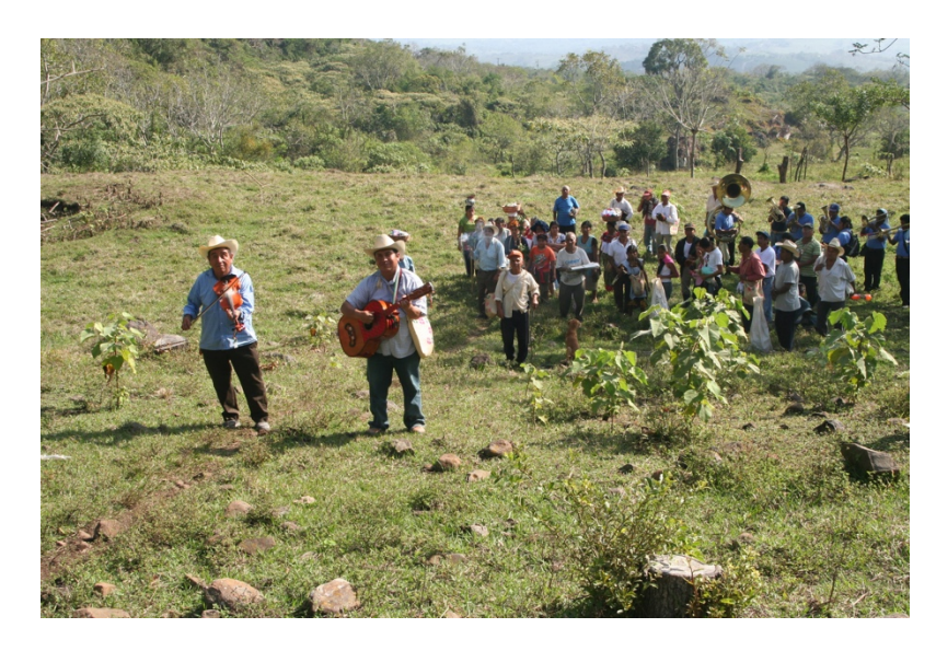
Figure 1: Musicians leading the procession to the Postectli Mountain during a chicomexochitl ceremony, Ixcacuatila (Photograph by Veronica Pacheco, February 2011).

participatory aspects resulting from the experience of this musical sequence throughout the performance of the chicomexochitl (lit. "sevenflower"), one of the rain ceremonies offered the mountains. The rain ceremonies are prominent at the south site of the municipality where the Postectli Mountain, a ceremonial center, is located. In several Nahua towns in this area, I traced principles of participation—which I denominate communal reciprocity—in religious secular settings to illustrate how the experience of sound, the