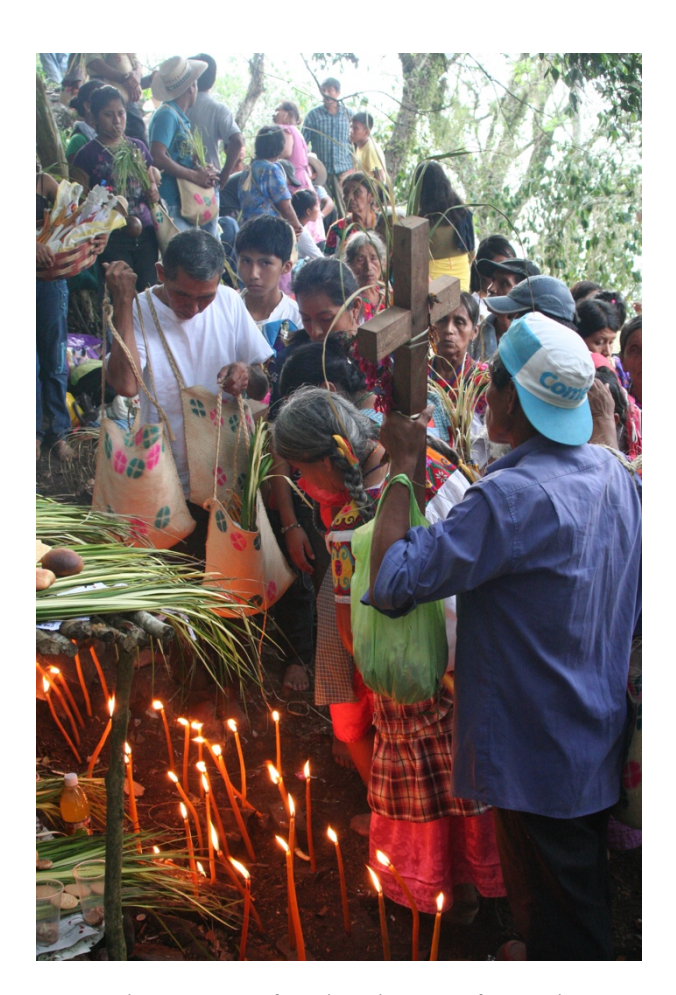
Figure 4: The congregation from the Nahua town of Limon placing offerings and lighting candles at the altar located on the foothills of the Postectli Mountain in the chicomexochitl ceremony (Photograph by Veronica Pacheco, June 2011).

Throughout the ritual many events take place, which conclude with the offering in altars for the pantheon of deities in the xochicalli, water sources, caves, and the mountain (see Fig. 4 and Fig. 5 for examples of altars and offerings). The congregation engages in different activities to prepare the offerings that include marigold flowers (cempohualxochitl) and palm (coyol) arrangements, food, and chickens and turkeys, whose blood is essential for the offerings. The ritual specialist cuts the paper to give shape to the numerous deities, which are eventually displayed on the altars (see Fig. 3). While the images of Catholic saints, Jesus Christ, and the Virgin Mary are maintained in the xochicalli temple, only the cut-paper images representing the pantheon of deities are displayed in the other altars located in the springs, caves, and the mountain. The music is ubiquitous in the process of preparing the offerings, when the ritual specialist cuts the paper, and while the congregation makes their offerings. In the diverse religious activities that characterize the Nahua towns with the presence of several Christian sects, the