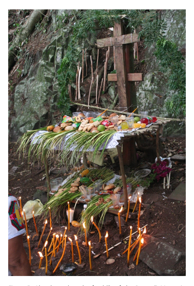
Figure 5: Altar located at the foothills of the Postectli Mountain containing offerings placed during the chicomexochitl ceremony.

It has been observed in several Nahua towns in the Huasteca region that congregations actively get involved in la costumbre rituals through music (Gómez Martínez 2012; Nava Vite 2012; Sandstrom 2005). Sandstrom's descriptions of a chicomexochitl ceremony at the Postectli Mountain frequently highlight the role of music in engaging participation. Similar to the case presented here, in Sandstrom's accounts people engaged with music while dancing at the xochicalli temple, paced their walking in pilgrimage towards the mountain, caves, and springs, or danced in front of altars while presenting offerings. Among the descriptions of the congregation's engagement in the chicomexochitl ceremony, Sandstrom also describes the happiness felt while people successfully finished the ceremony together.