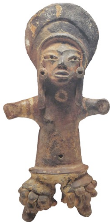
Figure 1: Female figurine with headdress and leg rattles made of clay. Provenance unknown; Middle Preclassic period (950–400 BC).

The Tarascans, who had imported the knowledge of metallurgy from Central and South America (Ecuador and Peru) via maritime routes, developed techniques of bell manufacturing emphasizing specific sound and color properties that expressed fundamental religious beliefs (Hosler 1995: 113). Bells and other metallic objects were worn by elites and nobles and used in rituals. One of those sounds pertaining to the sacred paradise in Aztec cosmivision were the sounds of bells, “associated with the shimmering, colorful, singing birds and with human voices that represent deities and their human transformations” (Hosler 1995: 107). Diffusion by trade or migration brought metal bells, maybe including the concepts associated with their sound, to the less stratified societies in the Mesoamerican