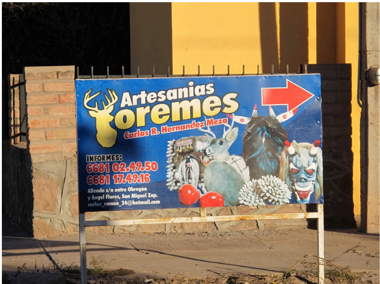
Figure 7: Advertising a mestizo-owned artisan workshop in San Miguel Zapotitlán, Sinaloa.

The artificial desiccation of the alluvial plains for the extraction of irrigation water increased depressions that are at risk of temporary flooding during the rain season. Over the decades, the government relocated many indigenous people from these zones into newly created settlements on higher grounds. Despite the hydroelectric dams up in the Sierra to regulate the rivers' water flow, the floodplains are still prone to occasional inundation. Yoreme keep their ténabarim stored away in a plastic or cotton bag when not in use: like for other things in their humble dwellings, a nail will do to keep them off the ground and dry (Fig. 6). Apart from possible damage by water, the use of the leg rattles during the rituals also wears them off. For instance, one of the movements pascola dancers may do to create a harsh rattling sound is to hit their lower legs together, squashing the tender cocoons; or dancers may accidentally step on the ténabarim and crush them if the string comes loose during the dance. If taken good care of, however, ténabarim can last a lifetime despite the delicate material. The need to manufacture a new pair of leg rattles for one's own use is usually of economic nature. As already mentioned, when performing at a fiesta (ceremony) outside their community, dancers may be enticed to sell their ténabarim for dearly needed cash. However, few Yoreme make leg rattles with a commercial intention.