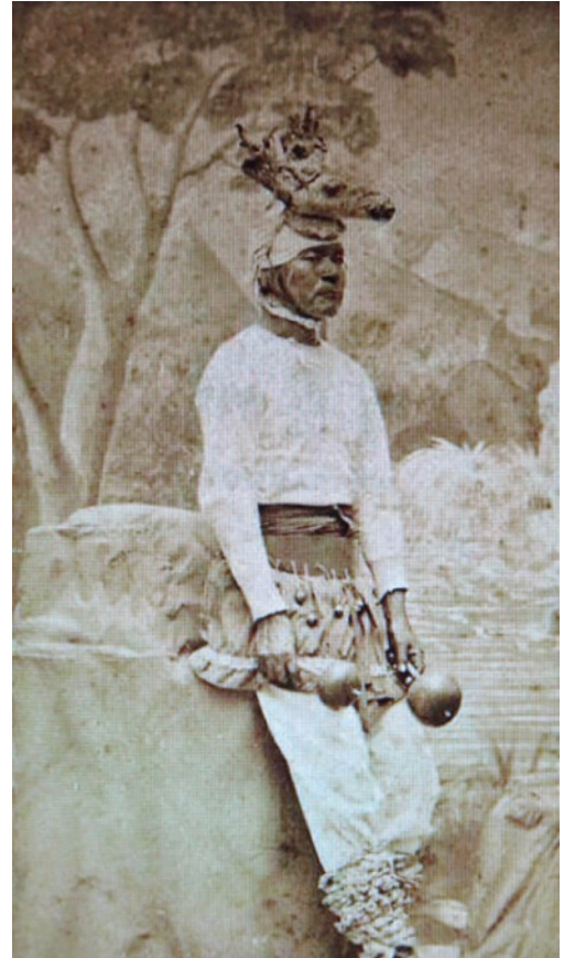
Figure 2: 1870 carte-de-visite . Provenance unknown.

We know of deer and pascola dances from nineteenth- and turn-of-the-century sources (Hardy 1829, Zúñiga 1835, Escudero 1849, Velasco 1850, Hernández 1902, Hrdlička 1904), 16 but