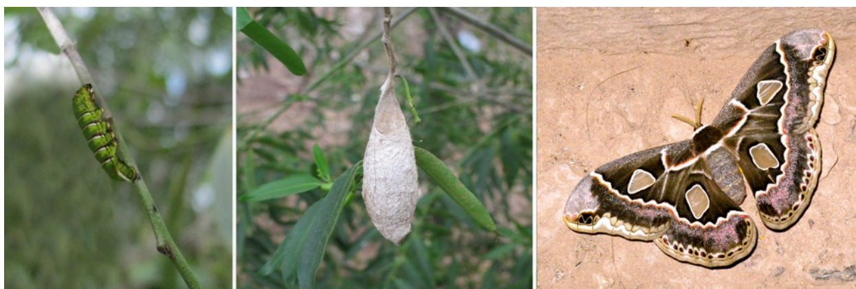
Figure 4: Caterpillar, ténabari, and mariposa cuatro espejos (male).

foothills away from the coastline, the cocoon walls are too leathery to make a pleasing sound, but they last longer. The pupae remain dormant throughout the dry season, their ash-colored cocoons hardly distinguishable from their surroundings. Prolonged droughts may make them stay inside their chambers for several years. Due to human greediness, this stage in the cycle of a moth's life, as will be shown later, has become most vulnerable.