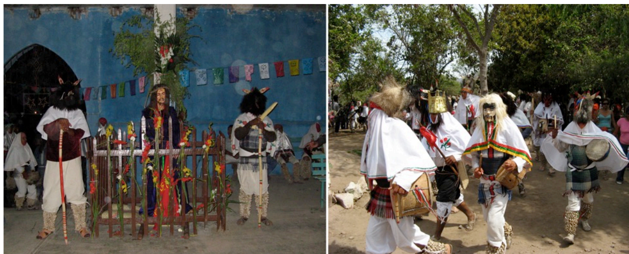
Figure 9: Judíos during Semana Santa in San Miguel Zapotitlán, Sinaloa.