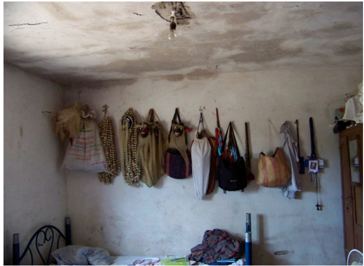
Figure 6 Ceremonial paraphernalia in a Yoreme house.