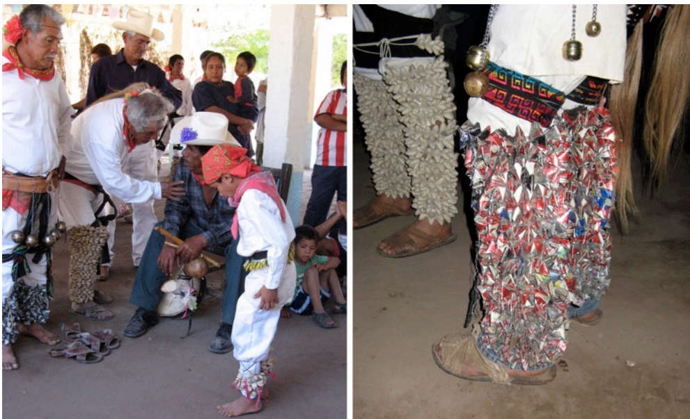
Figure 14: Leg rattles of insect- and man-made materials: plastic water hose and aluminum can. The boy deer wears a belt with squeezed beer bottle caps instead of hooves to practice the dance.

Deer and pascola dancers, musicians, and singers are, by tradition, bestowed with the responsibility to transmit their deep knowledge by way of sound and movement and so to convey the meaning of Yoreme humanity. Unlike in Yoreme culture, among the Tarahumara the deer has lost its symbolic significance: Deer hooves on the belts have been replaced with shell casings or tubes of tin foil, yet, according to Bonfiglioli (2006: 89), they retain their original connection to the hunt. For lack of deer hooves, some Yoreme deer dancers have substituted them with pig hooves, which are practically indistinguishable in shape as well as in sound — both aspects important to Yoreme deer dancers. The shortage of cocoons has forced dancers to be inventive: some use plastic water hoses or aluminum cans to fabricate their ténabarim (Fig. 14).