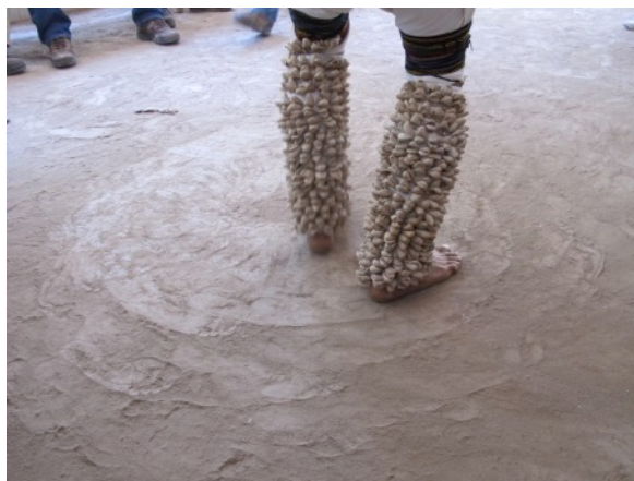
Figure 13: Footprints of dancing pascola .

Spiral motifs are found in a wide variety of representations throughout native cultures. Perceived as an entrance to the spirit world, the counter-clockwise spiral is one of the most common figures reportedly seen during shamanic trancing. 39 Upward–downward and spiral motions are essential in Yoreme performativity. The strings of ténabarim are wrapped around the leg spirally (working clockwise upward, but symbolically suggesting a motion toward the earth); the pascola dancers move counter-clockwise when dancing to the harp–violin music, imprinting a volute of footprints in the dirt (Fig. 13). 40