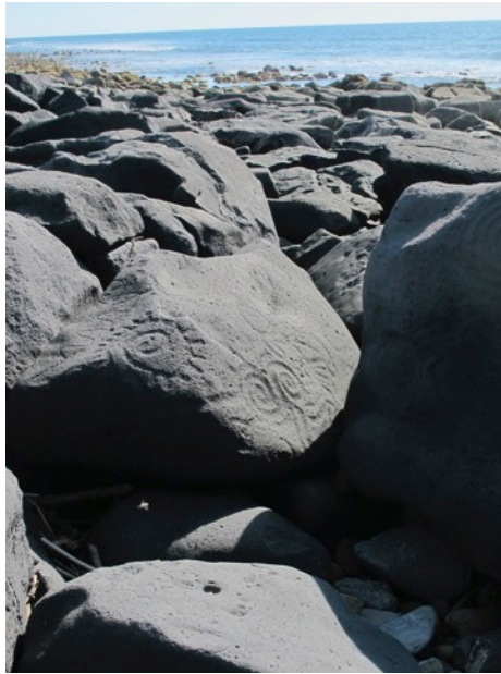
Figure 12: Peyote motif at Las Labradas.

Spiral motifs are found in a wide variety of representations throughout native cultures. Perceived as an entrance to the spirit world, the counter-clockwise spiral is one of the most common figures reportedly seen during shamanic trancing. 39 Upward–downward and spiral motions are essential in Yoreme performativity. The strings of ténabarim are wrapped around the leg spirally (working clockwise upward, but symbolically suggesting a motion toward the earth); the pascola dancers move counter-clockwise when dancing to the harp–violin music, imprinting a volute of footprints in the dirt (Fig. 13). 40