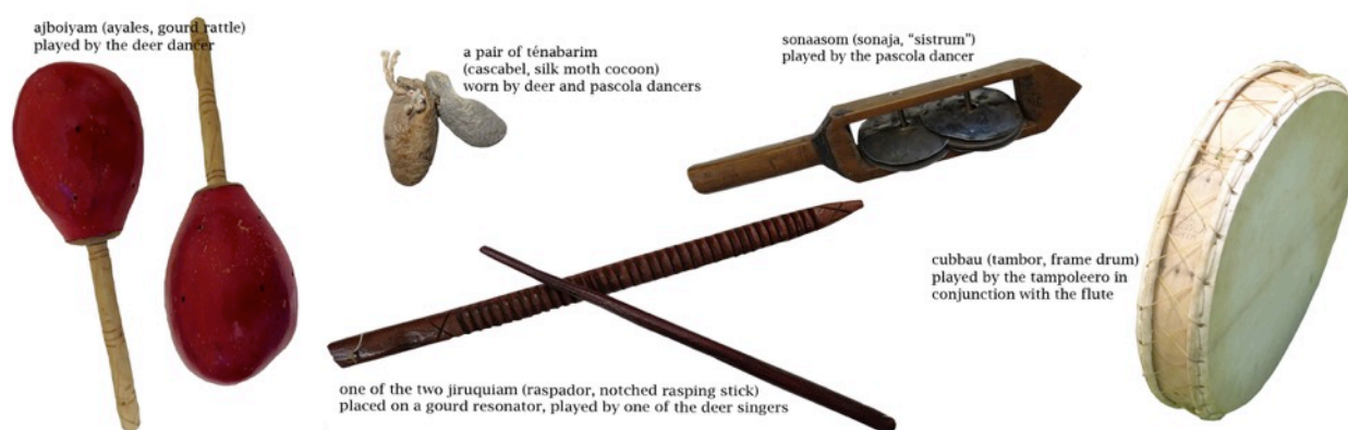
Figure 11: Sound-making instruments based on complementary dualism used in Yoreme ceremonies: gourd rattles, ténabarim, rasp (the second rasp has wider cut notches), a sistrum-like hand rattle, and a frame drum.

within themselves the duality of being and becoming, manifesting themselves as specific phenomenal beings (the sun, moon, animals, etc.), although, in so doing, they do not lose their original nature of constant becoming or intentionality” (Wright 2013: 45). Complementarity becomes the major organizing principle within all aspects of community life, from social to spiritual. Yoreme value qualities of sound without having developed a grand philosophical theory about the nature of music and beauty; thus, indigenous sound aesthetics is not readily available to the outside observer. As mentioned above, Yoreme fill each cocoon forming a pair such that they emit a different, but complementary pitch. Left and right cocoon leg rattles produce different pitches; the two notched rasps, the pairs of metal discs of the wooden hand rattle, the pair of the handheld gourd rattles, and the two membranes of the handheld frame drum all succumb to the principle of this complementary dualism (Fig. 11).