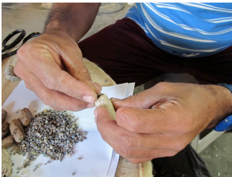
Figure 10: Preparation of the cocoons, "Artesanías El Chester."

The pairs are then sewed together using two cotton strings to interlink the stitches. The beginning loop in the string will be fastened to the dancer's big toe, from which it is wrapped around the lower leg, starting above the anklebone and working upward. Secured with the rest of the cotton strings, the ténabarim will stay put even during vigorous dancing.